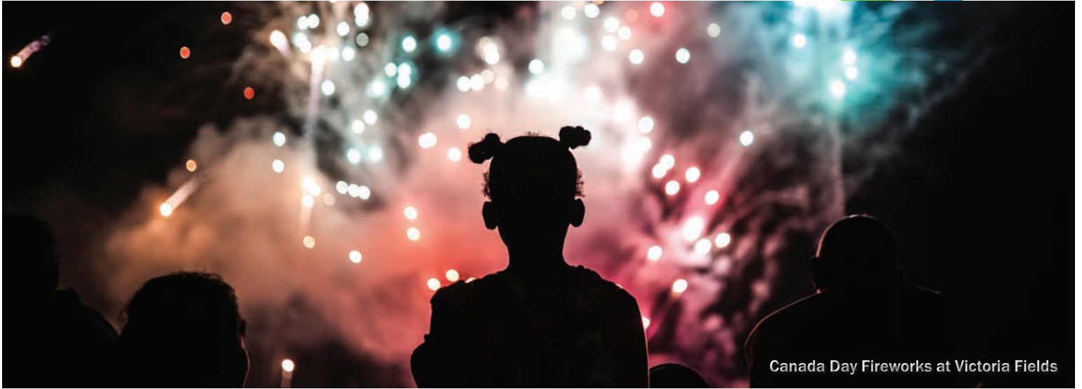
Canada Day Fireworks at Victoria Fields